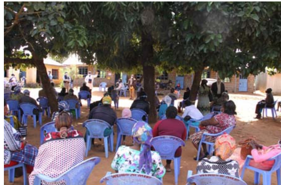
Mitaboni Boundless Love Medical Clinic, Kenya

Team Life. $510 was raised this past quarter for Team Life for funding of baby beanies, booties and blankets that are sent to crisis pregnancy centers.