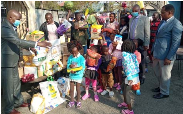
Food distribution in Kenya